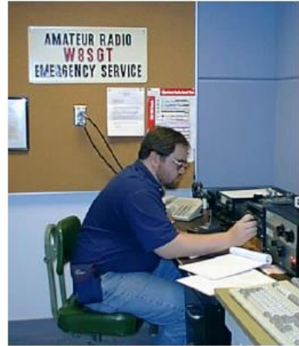
Devoted to Public Service