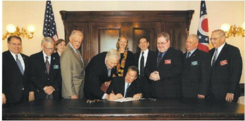
Sees any challenge through to the end (Signing of Ohio PRB-1 bill into law)