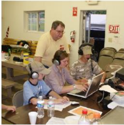
Observing a Youthful Field Day