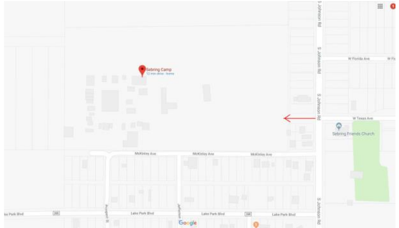
Map to Sebring camp. Note red arrow showing driveway. Click on photo to open full map.

Well, it's coming up again. Winter Field Day, that is. The big event comes up on the weekend of January 27/28. We will again be operating the club station from the Sebring Holiness Camp, on Johnson Rd (see map on this page).