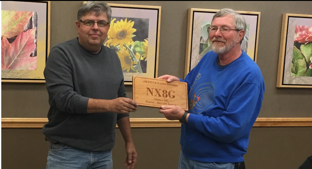
Rex, NX8G was the winner of AARC DX Contest plaque #1