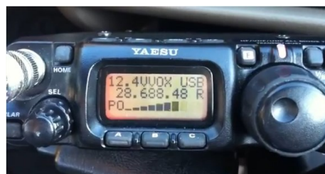
Kick ass QRP antenna setup for the ARRL 10 contest. http://youtu.be/mu_nLEU1M9c