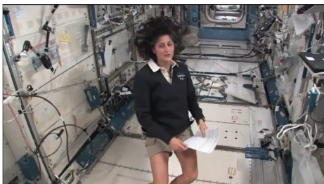
Sunita Williams gives a very interesting tour of the ISS. www.wimp.com/orbitaltour