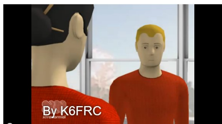
A lesson to all; Keep the spouse happy! http://youtu.be/O7kirdtd11c