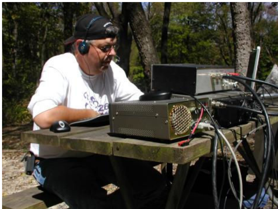
KD8MQ starts out strong in OSPOTA

The members of the Goodyear Amateur Radio Club likely locked up the "Most Parks Activated by a