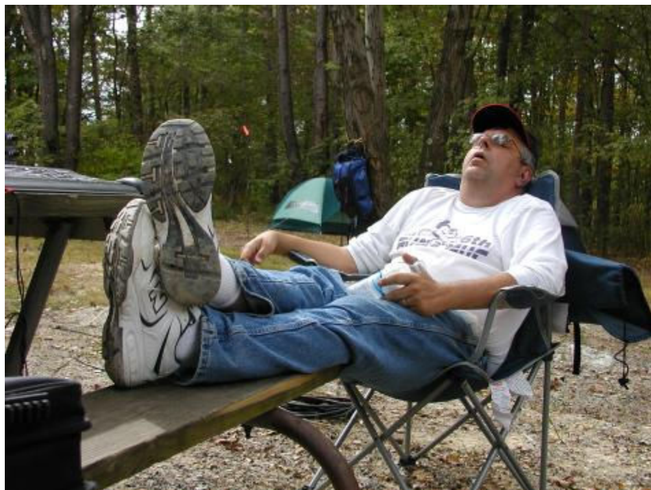
But, quickly ran out of steam!