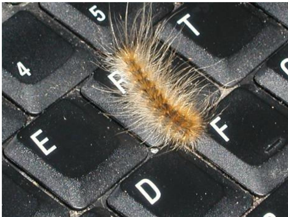
This little fellow fell from the tree, and landed on the keyboard. He's to blame for any logging errors!

It's not too early to begin scouting state parks for next September. See you next year, and watch out for Sasquatch!