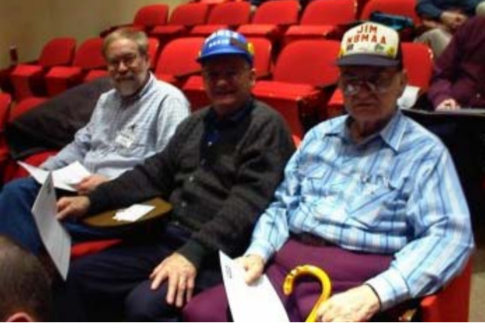
Lets get this show on the road!