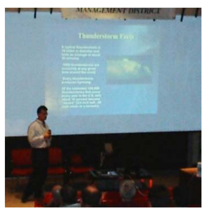
Here, our Instructor from the NWS dous an admirable head of filling our heads with