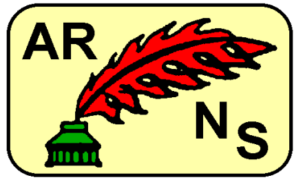
Amateur Radio News Service