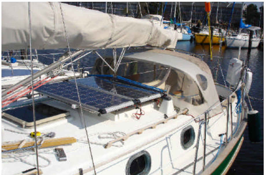
New solar panels on deck