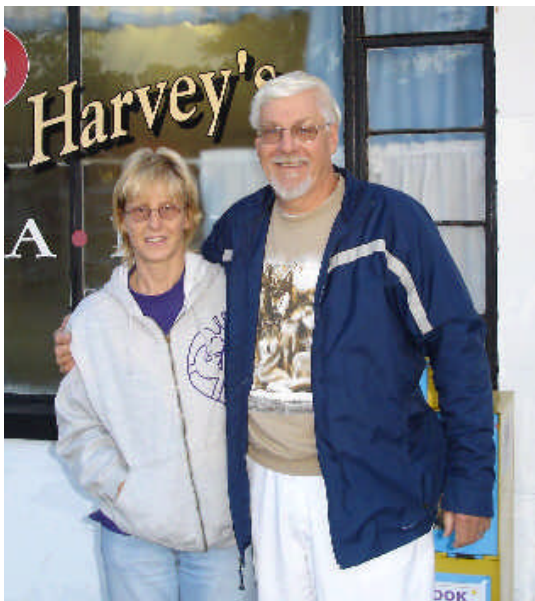
KE8KH and N8EWV