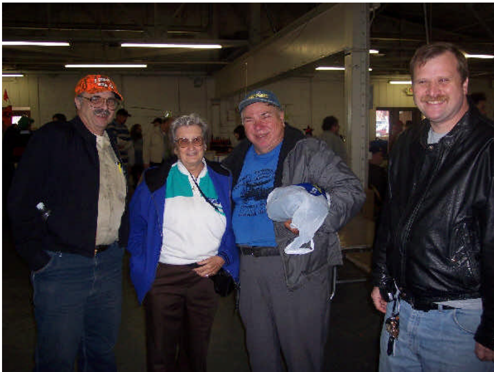
N8PLA, KB8IVS, K8LTG and KC8ETZ at Massillon Hamfest.