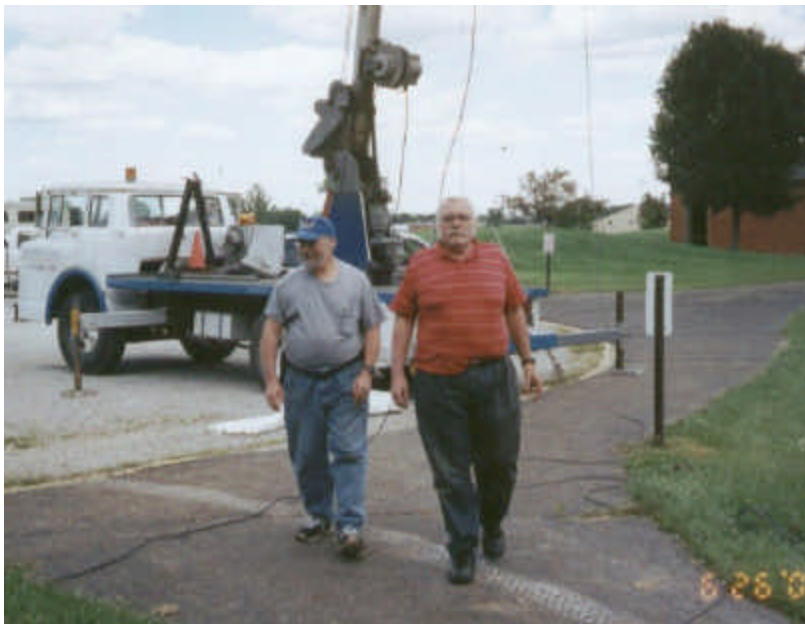
Typical Hams. They don't miss many meals. KE8VE & WA8WHP at Field Day 2004