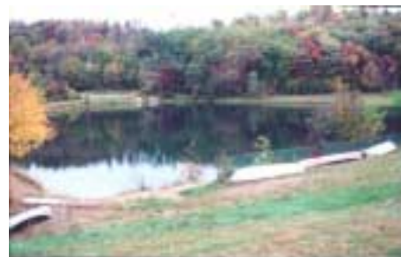
I forgot my rod and reel