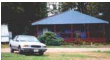
The KD8MQ/3 Shack

Anyway, using this really great PA QSO Party website ( http://www.qsl.net/kd8mq/paqso/paqso.htm ), I decided that Armstrong County would be a good QTH for the second weekend in November. So, a phone call to the Armstrong County Visitors Bureau, and a weekend