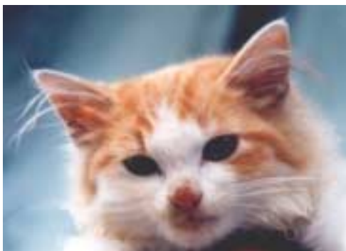
One of the Locals

I arrived in PA on Friday afternoon. The station setup began immediately, supervised by a two-month-old kitten that seems to have adopted me. In spite of