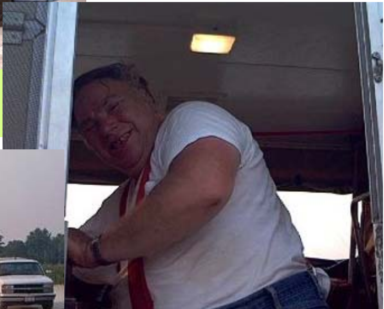
Just heard we beat them ten meter boys YIPPIEE"