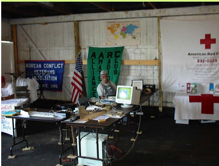
This year, we will again have a booth at the Mile Branch Grange Fair, June 25-27