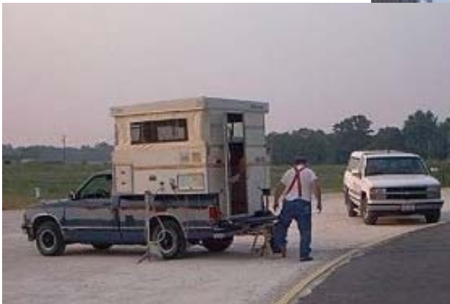
."WHEW" Getting pretty tuff on 40 gotta "Shake It Off" every so often"