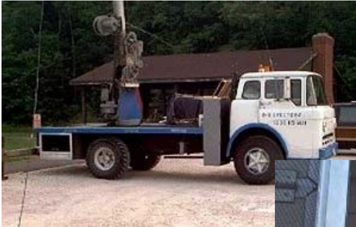
that old sign truck is here again??? (still! Maybe this year we can get it to start! - KD8MQ )