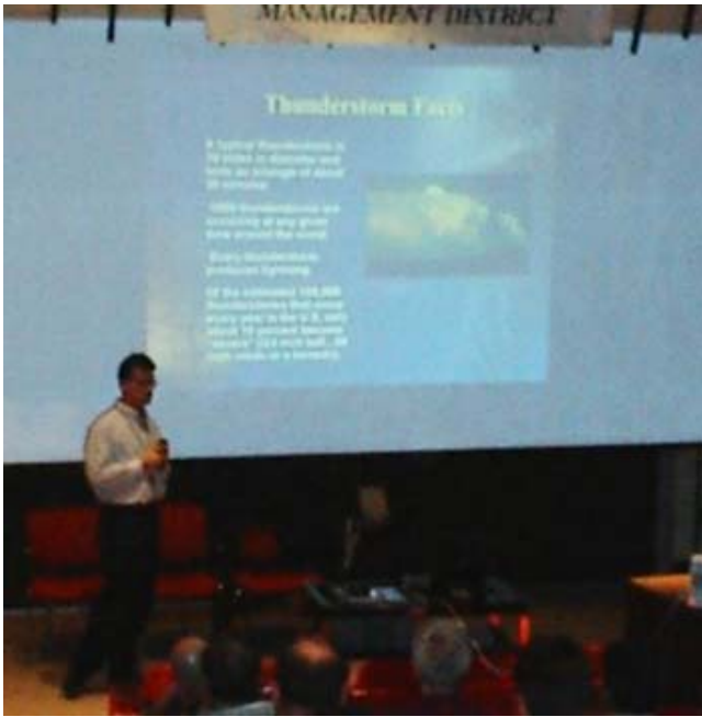
Here, our Instructor from the NWS does an admirable head of filling our heads with