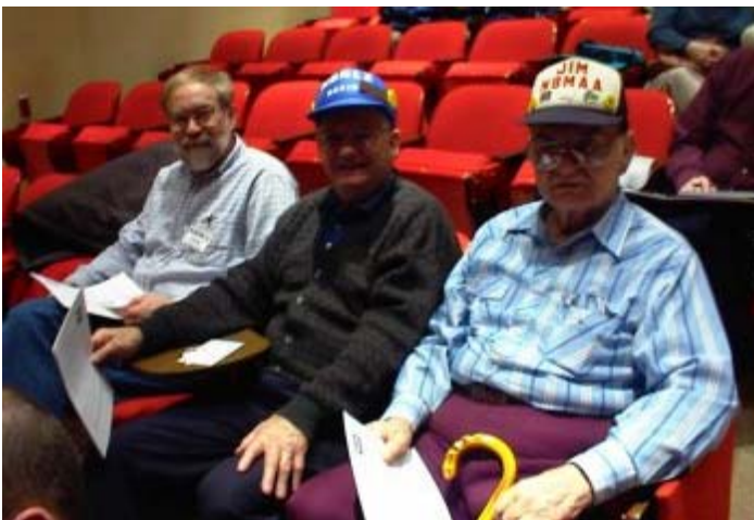
Lets get this show on the road!