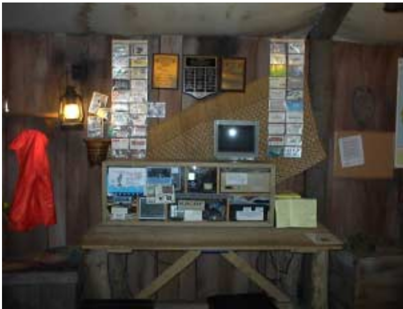
The Amateur Station at the Rain forest in Cleveland Zoo

As always, you can contact me with any questions that you might have. So give it a try. I hope you'll try it soon.