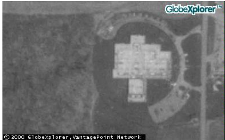
Here's an aerial view of our Field Day Site

So, make plans come out and socialize. We'll look forward to seeing you.