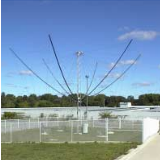
This is the Multi band antenna at FEMA Headquarters in Columbus. I think they said the bandwidth was "DC to daylight," or something like that.