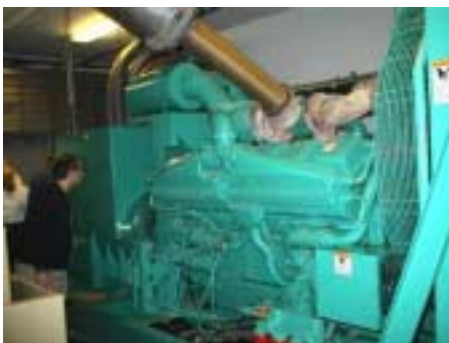
HMMMM! I wonder if this would be big enough for Field Day?