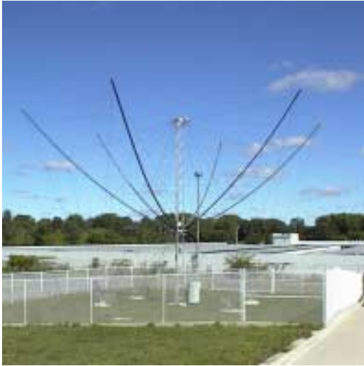
This is the Multi band antenna at FEMA Headquarters in Columbus. I think they said the bandwidth was "DC to daylight," or something like that.