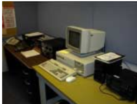
This is the operating position of W8SGT, at FEMA headquarters