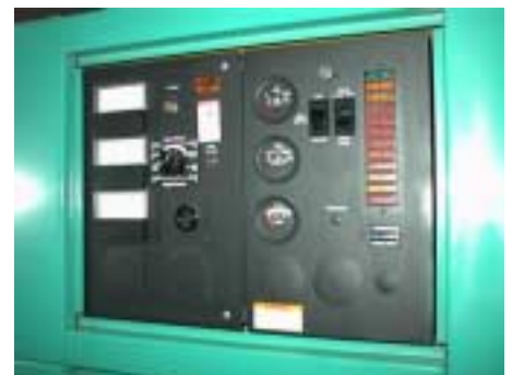
Control panel for the generator at FEMA headquarters