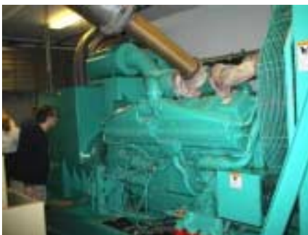
HMMMM! I wonder if this would be big enough for Field Day?