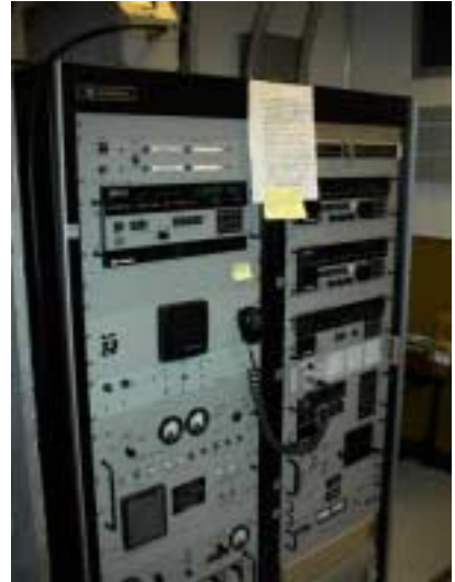
This 1 KW rig is at the other end of the feedline.